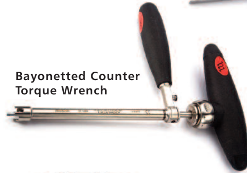
Bayonnetted Counter Torque Wrench

Bayonnetted working tip for straight forward, secure alignment of screw body to rod connection