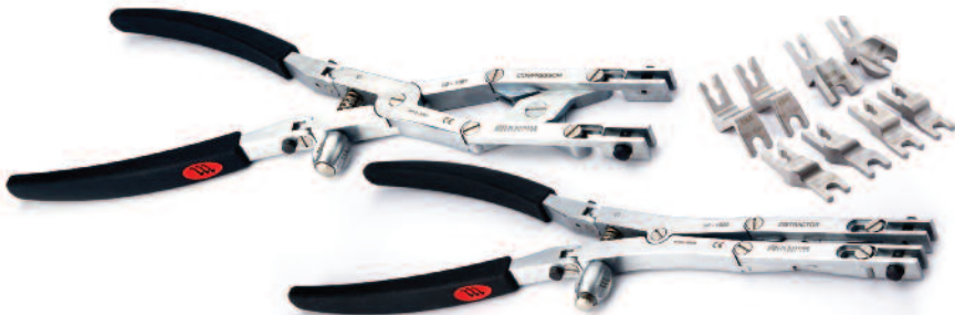
Compressor and Distractor

Bend away handles for improved visibility, broad modular tip selection to address various anatomical challenges