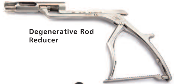
Degenerative Rod Reducer

Trigger handled instrument for smooth, one-handed rod reduction