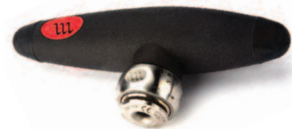
Ratcheting Torque Limiting Handle