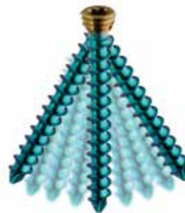
Fixed angle and 15° polyaxial locking